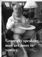
Generally speaking, men are more inventive.

Men are from Earth, women are from Earth. Deal with it.